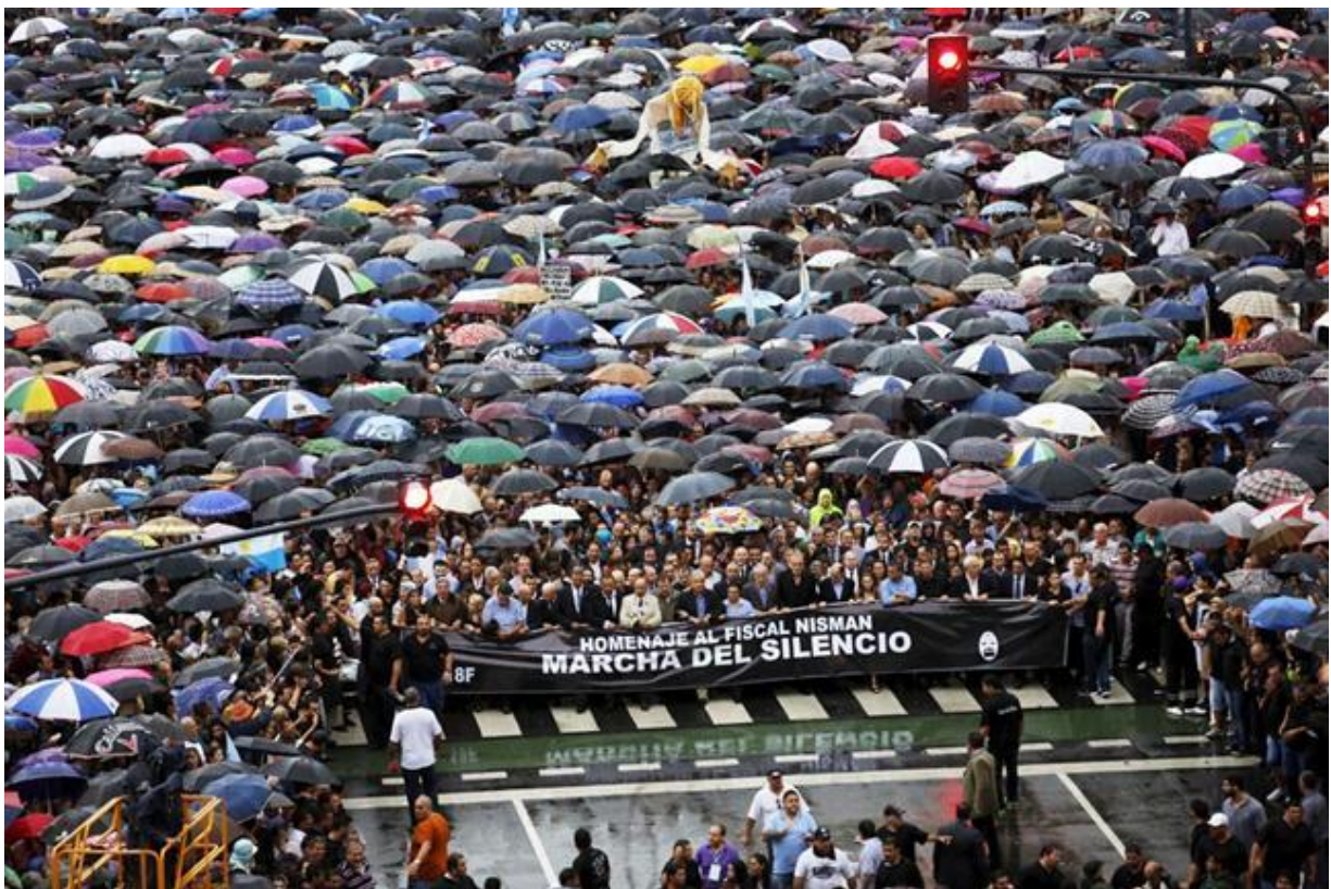
Figure 1: Hundreds of thousands march on the one month anniversary of Nisman's death, demanding justice (Photo from La Nación).

The government's lack of credibility – it has lied about everything from its basic economic statistics to its homicide rate – is evident in recent polls showing that 70 percent of the people believe the crime will never be solved. This is a shocking vote of no confidence in the government. 11 Independent of Nisman's work, the government is roiled daily by corruption scandals: the vice president is under indictment; the president's main financial handler moved tens of millions of dollars to offshore accounts without explanation of where the money originated; and, the president's son and presumptive heir, Máximo, is under criminal investigation in a festering money laundering case. 12