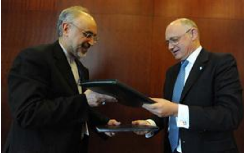
Figure 2: Iranian Foreign Minister Ali Akbar Salehi and Argentine Foreign Minister Héctor Timerman exchange signed copies of the MOU on the AMIA case

Fernández de Kirchner has increasingly tied her fortunes to the failed radical populist model of Venezuela’s late Hugo Chávez: a destructive combination of authoritarian, one-person rule, massive corruption, economic collapse, and the hollowing out of institutions which could provide oversight and accountability. This includes targeting the independent media and unilateral renunciations of international legal treaties and agreements. New evidence has been emerging from U.S. courts in a sprawling money laundering case against a one-time small town bank teller who rose to control hundreds of millions of dollars allegedly being laundered on behalf of the Fernández de Kirchner and her children through more than 100 shell corporations registered in havens ranging from the state of Nevada, to the Seychelles and Switzerland. 15