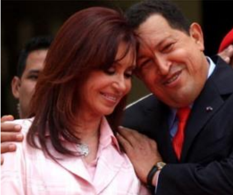
Figure 3: Fernández de Kirchner and Chávez in happier times