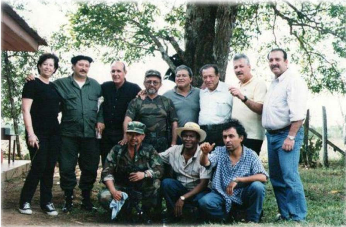
Figure 2: Salvadoran President Salvador Sánchez Cerén (center) with FARC leader Manuel Marulanda (immediate left) and Raúl Reyes (immediate left, in camouflage) at a FARC camp in 2001.