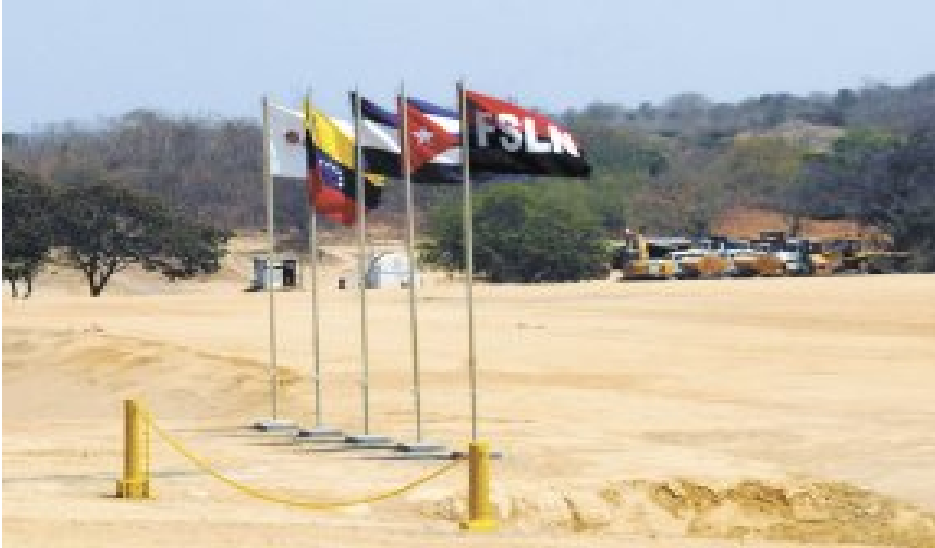
Figure 3: The empty field where $237.2 million have reportedly been spent over the past five years to build an as-yet invisible oil refinery.

Yet all that is visible of the $237.2 million dollar investment is an empty field of compact earth with the flagstaffs bearing the flags of Nicaragua, Venezuela, Cuba and ALBA. Construction machinery has remained idle at the site for three years. 40